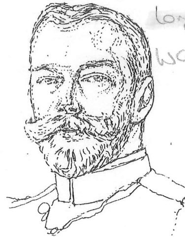
Nicholas II, the last Russian Tsar

When the unrest in the capital began, Nicholas had been at the General Headquarters of the Russian army at Mogilev, in the western part of the Empire. He attempted to return to Petrograd but, because of