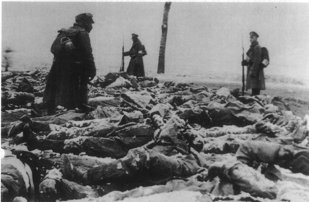
Russian soldiers before burial. As a result of heavy defeats Russian soldiers became demoralised.

But there is general agreement among historians of all persuasions about the ways in which the war, once it had broken out, led inexorably to the events of February 1917. The effects of the war on the economy, on the armed forces, and on the political system all combined to bring about the revolutionary overthrow of tsarism.