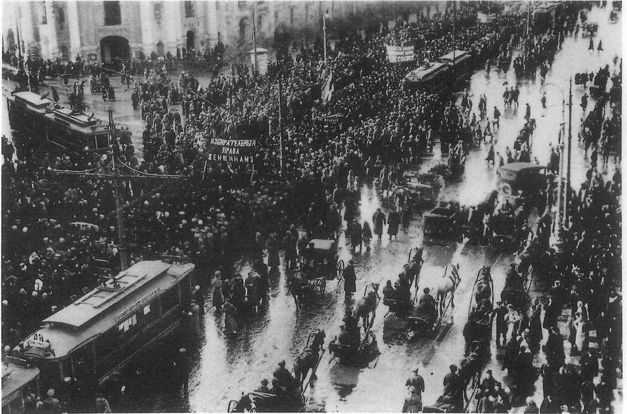
Demonstrations against the government spread to Nevsy Prospect (see map) Petrograd's main street